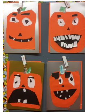
Above: Spooky pumpkins on our infant corridor