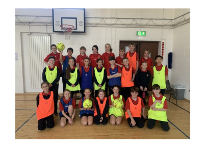
PE Lesson Using New Equipment